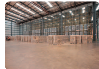
14.1m high bay